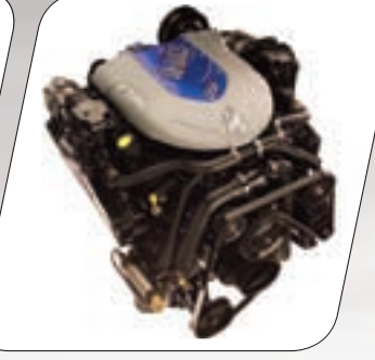
Model Scorpion 377 MPI Towsports Displacement 6.2 Litres Rated Power 340hp