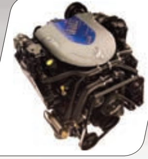
Model Scorpion 350 MPI Towsports Displacement 5.7 Litres Rated Power 330hp