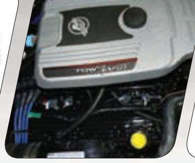
Displacement 5.7 Litres Rated Power 315hp