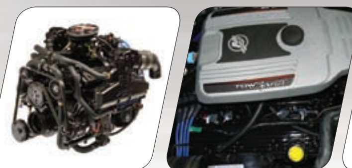
Model 315 Carb Towsports Displacement 5.7 Litres Rated Power 315hp